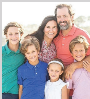
The Moore Family

While we continue to respond together to an