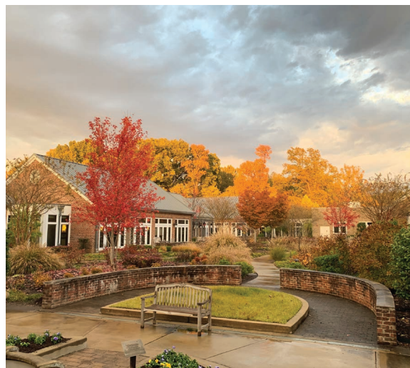
The courtyard at the Methodist Hospice Residence

Inspired by the founding mission of the Hospice Residence and the vision of the many donors who made it possible, our incredible team of caregivers work every day to give their patients and their loved ones peace, comfort and dignity.